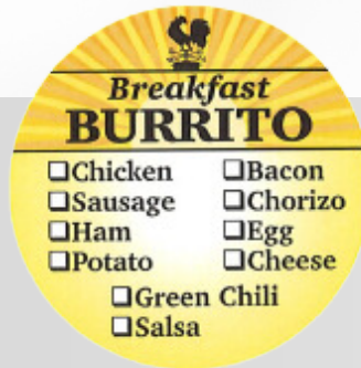
ITEM #101412 2" circle, 500 Labels per roll