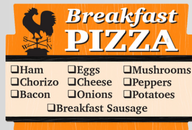
ITEM #100899 2" x 3", 500 Labels per roll